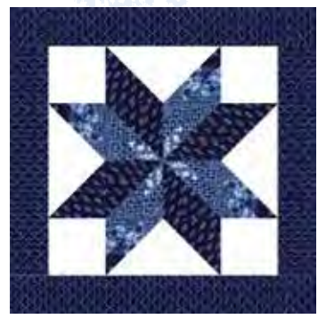
CCTD 166 / CCTD 166G Fractured Star One Big Block

One kind word can warm three winter months.