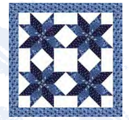
CCTD 166 / CCTD 166G Fractured Stars 4 Block Lap