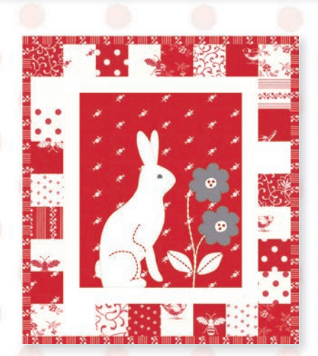
BHD 2951 / BHD 2951G Sweet Pea Size: 8"x9" MC Friendly