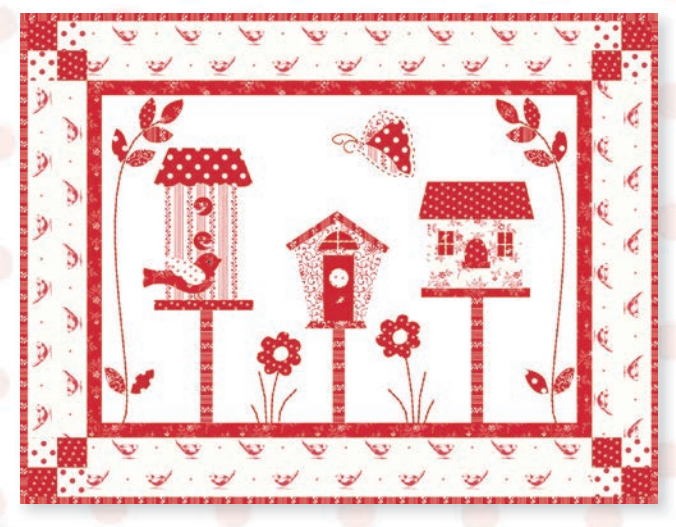
BHD 2950 / BHD 2950G The Potting Shed Mini Size: 24"x19" PP Friendly