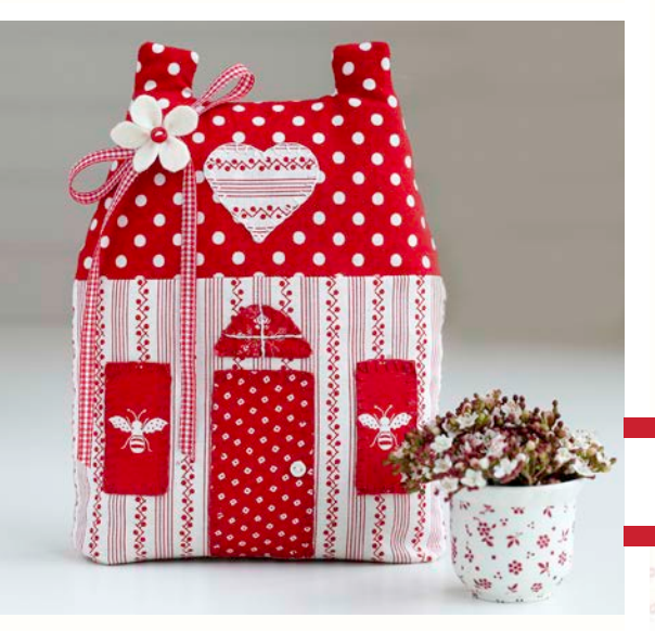
BHD 2153 / BHD 2153G Hollyhock Cottage Size: 6"x8"