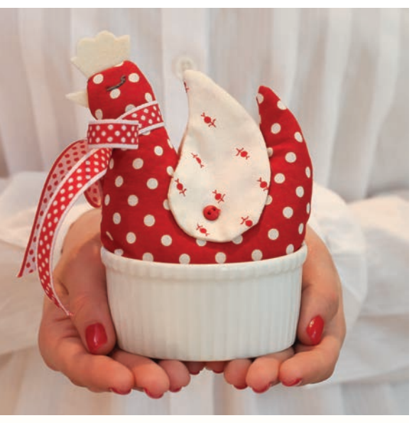
BHD 2152 / BHD 2152G Rosie Size: 5"x5"