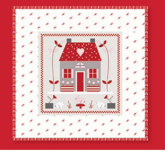
BHD 2154 / BHD 2154G The Cottage on the Corner Cross Stitch Size: 12"x12"