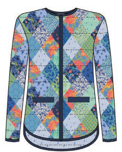
GRAINLINE STUDIO GS 16002 Tamarack Jacket

something delicious and unforgettable, welcome to the Garden Society.