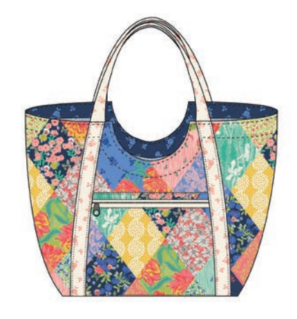
ANNA GRAHAM/NOODLEHEAD AG 533 Poolside Tote

FRIDAY PATTERN COMPANY FPC 031 Saltwater Slip Dress