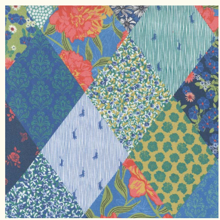
11898 13R 11898 11R