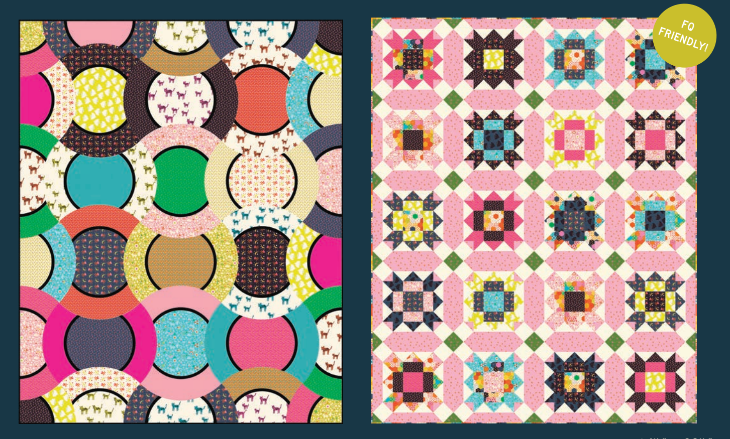
ES 551RPL Everyday Stitches | Ripple Effect 57" x 71" CKQ